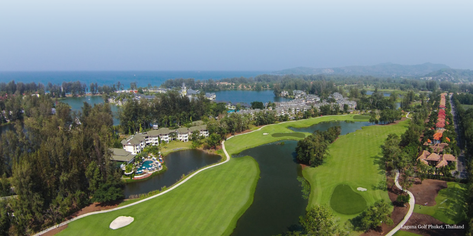
Laguna Golf Phuket, Thailand

Beyond an extensive suite of exceptional services and amenities, homeowners will benefit from the professional and hassle-free management of their property as part of Garrya Phuket Hotel's exclusive collection. Embrace luxurious beachfront living and enjoy basking in a state of utmost comfort and peace of mind.