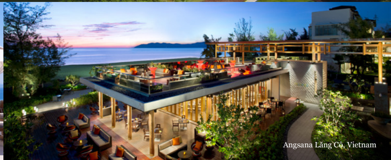
Angsana Lăng Cô, Vietnam