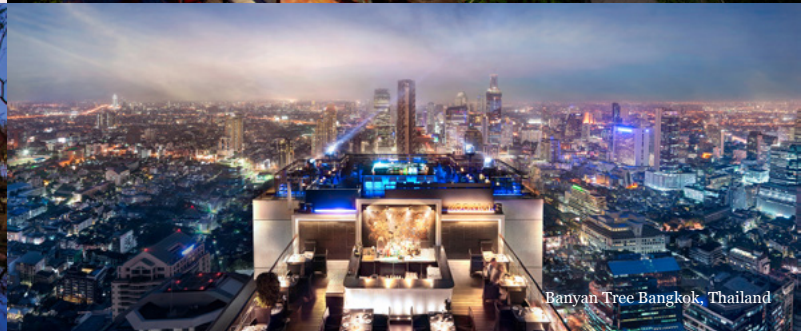
Banyan Tree Bangkok, Thailand