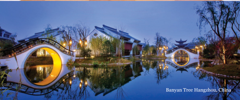
Banyan Tree Hangzhou, China