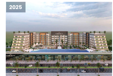
The Community - Motor City Developer, contractor and exclusive sales and marketing