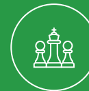
Open Air Chess