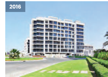
J8 Developer and exclusive sales and marketing