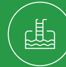
Infinity Swimming Pool

Meticulous attention to detail has been paid to every aspect of the building to make it the most desirable and convenient place to stay either short term or long term.