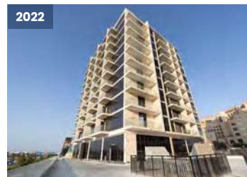
O Ten Developer and exclusive sales and marketing