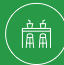
Restaurants & Cafe