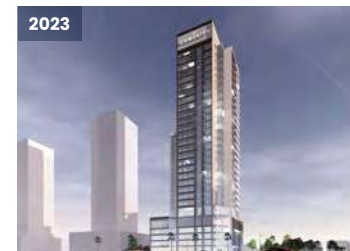
The Community - JVT Developer, contractor and exclusive sales and marketing