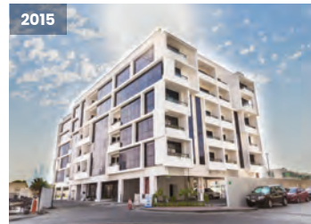
J5 Developer and exclusive sales and marketing

Operating with a dynamic and evolving strategic approach to developing new opportunities, the collective expertise and market knowledge of our trusted team of highly experienced industry professionals enables us to provide the best client experience, from initial concept to handover and beyond, whilst maintaining optimum performance for both local and international clients' investments.