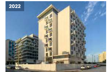
Mysk Developer, contractor and exclusive sales and marketing