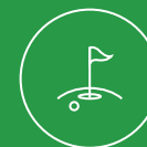
Open Air Golf Simulator