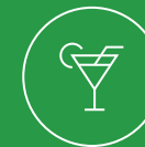
Cafe & Juice bar