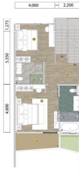
2 st Floor Plan