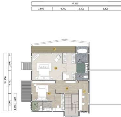
2 st Floor Plan