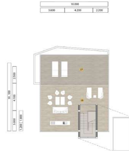
3 st Floor Plan