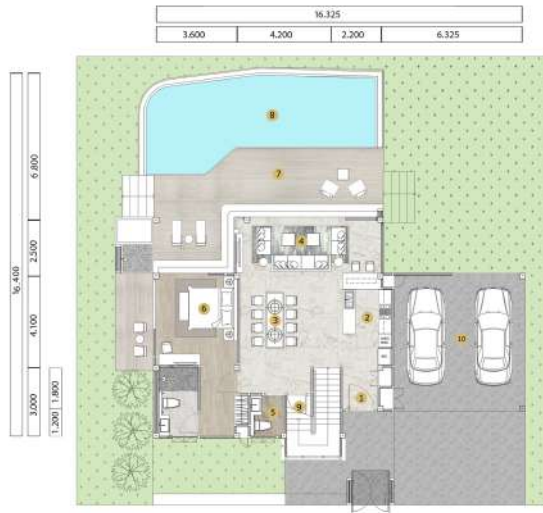
1 st Floor Plan