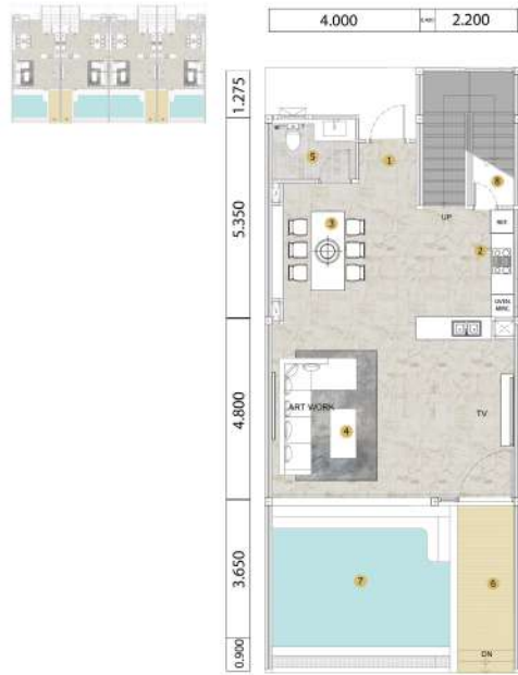
1 st Floor Plan