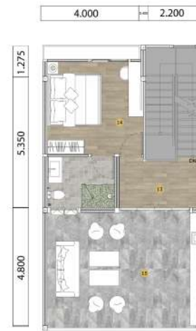
3 st Floor Plan