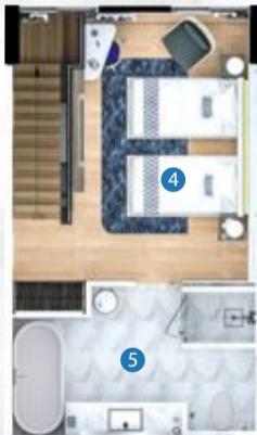
2nd floor plan