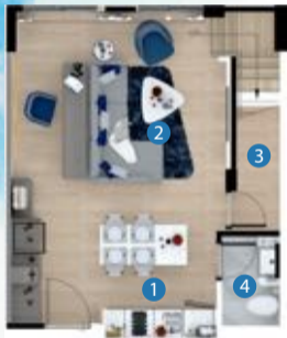
1st floor plan