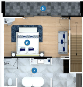
2nd floor plan