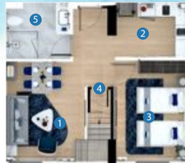
1st floor plan