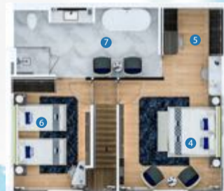
2nd floor plan