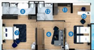
2nd floor plan