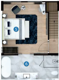
2nd floor plan