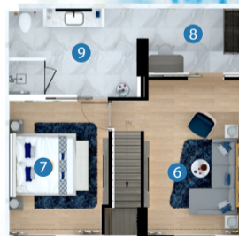
2nd floor plan