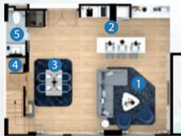
1st floor plan