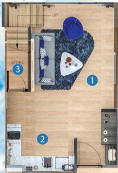
1st floor plan