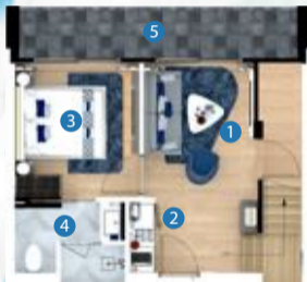
1st floor plan