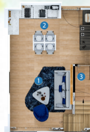
1st floor plan