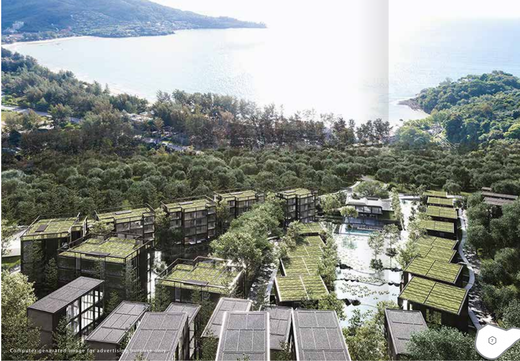
Computer generated image for advertising purpose only