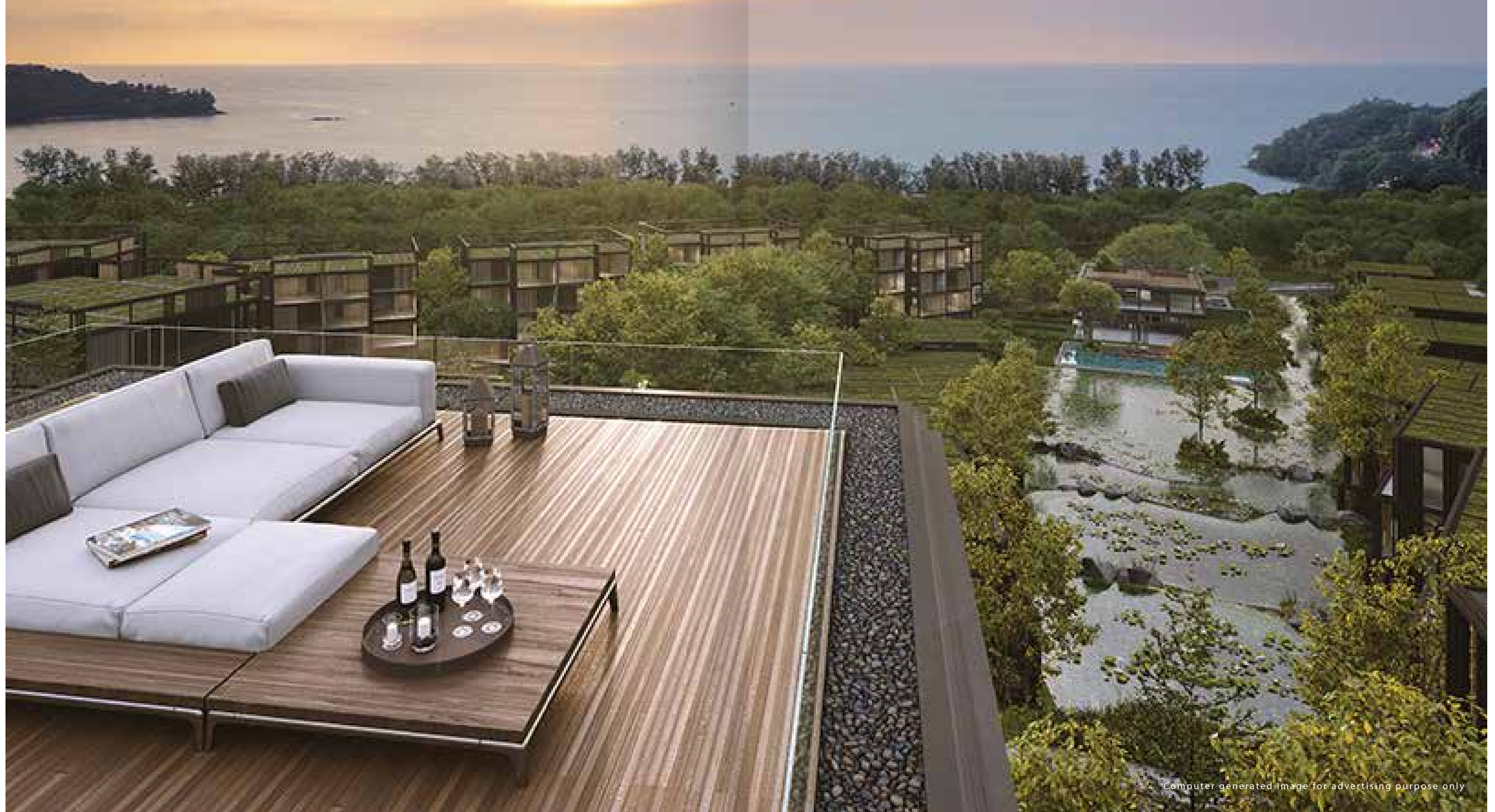
Computer generated image for advertising purpose only